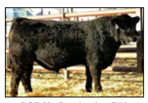
DCR Mr. Domination D76