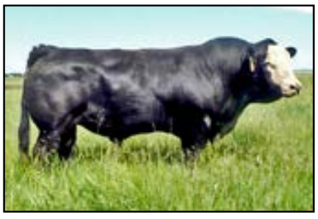
JBS BIG CASINO 336Y

Purebred ASA# 2602861 Sire: RC Club King 040R Dam: JBS Miss Des 301 512N