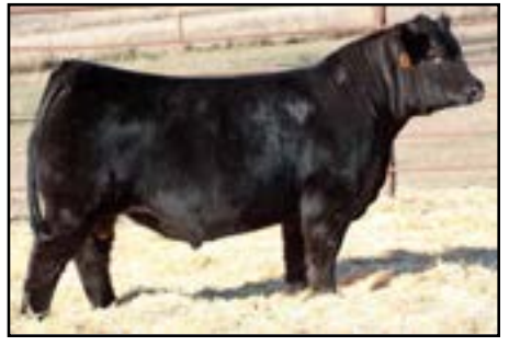
W/C Night Watch 84E

Purebred ASA# 3336327 Sire: CCR Anchor 9071B Dam: Miss Werning KP 8543U