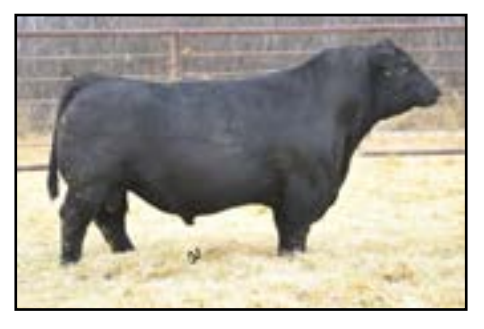
TJ Main Event 503B

1/2 Simm ASA# 2891336 Sire: Mr. NLC Upgrade U8676 Dam: TJ Miss New Day U14