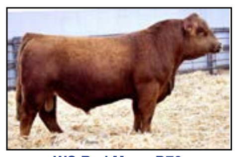
WS Red Moon D76

Purebred ASA# 3115609 Sire: W/C Executive Order 8543B Dam: DCR Ms Moonshine B38