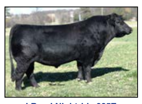
J Bar J Nightride 225Z 5/8 Simm ASA# 2628568 Sire: GW Promium Boot 021T6

Sire: GW Premium Beef 021TS Dam: J Bar J Miss ND 793X